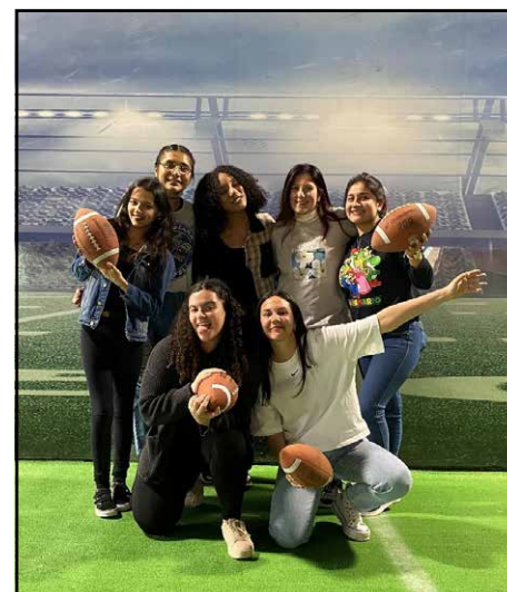
The girls enjoyed playing Fowling in Michigan