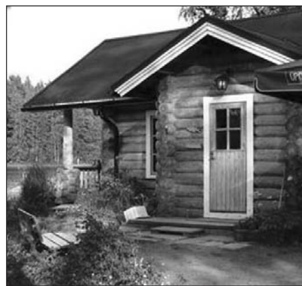
Traditional sauna by lake

It is not possible to talk about Finland without mentioning the sauna! Sauna is not just the only Finnish word to have entered the world vocabulary – it's a ritual, an institution, an essential element of the Finnish way of life. It can also be very relaxing, exhilarating and enjoyable, and no visit to Finland is complete without sampling the sauna. The Finnish sauna has its own unique character and traditions. Although it was