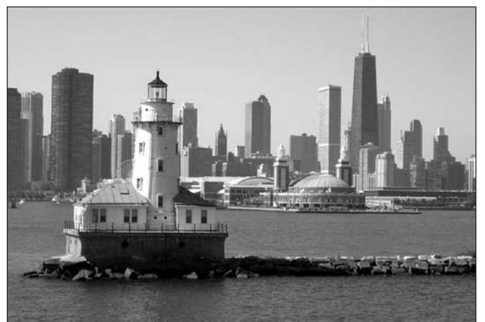
Chicago skyline in all its glory!