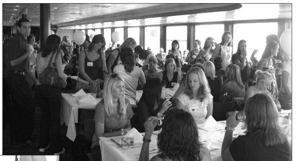
EurAupair Au Pairs finding the best seat for the cruise!